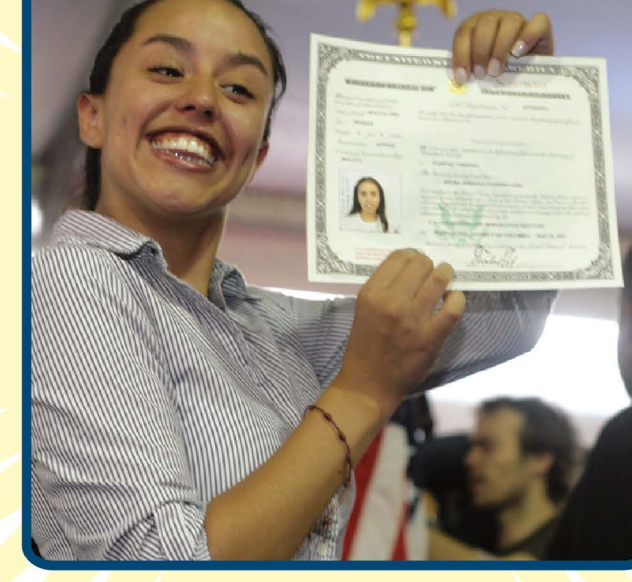
Receive a Certificate of Naturalization

Demonstrate an ability to read, write, speak, and understand basic English