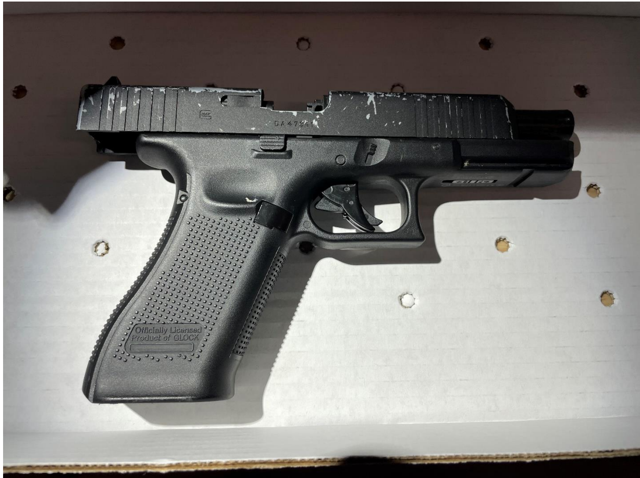
The image above shows the Glock 17 Gen 5 pellet gun that Nyah Mway possessed during the incident.

According to the UPD Incident Report, UPD Officer Silas Fry recovered the magazine from the pellet gun on the northern side of the road in front of 914 Shaw Street at 3:07 a.m. on June 29, 2024.