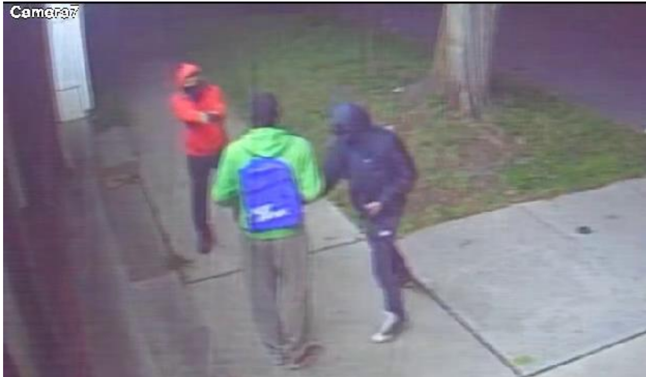
Still image from the security video of the June 12, 2024 robbery. J.M. is in the green hoodie. The person in the red hoodie is holding what appears to be a black handgun.

A security camera at 1212 Hart Street recorded the robbery (which can be viewed here ). As the security video showed, a person wearing a red hoodie pointed what appeared to be a black handgun at J.M. According to J.M., the armed person said, "give me everything." As the video showed, J.M. handed his backpack, cell phone, and headphones to the person wearing a blue or dark colored hoodie. The two people quickly ran away. No shots were fired.